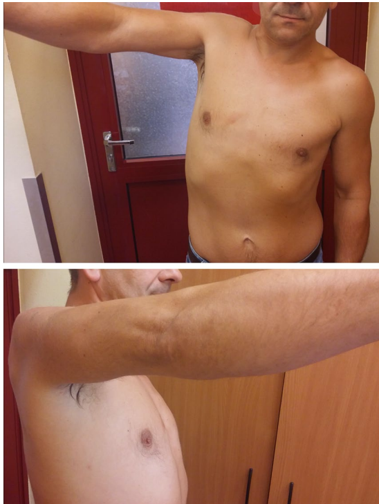
Fig. 3 Late complication after shoulder arthrodesis in the form of a fracture of the humerus distal to the plate. (A) Humerus shaft fracture, (B) open reduction and plate fixation, (C) complete humerus shaft union.

Groh et al suggest that the degree of internal rotation correction should be determined based on the patient's weight. For slim patients, he recommends setting the internal rotation to 60° and for obese patients to 40°. After surgery, the average limb position was 13° of flexion, 16° of abduction, and 48° of internal rotation, which resulted in resolution of shoulder pain in all patients, and the ability to perform all six assessed daily activities. 18