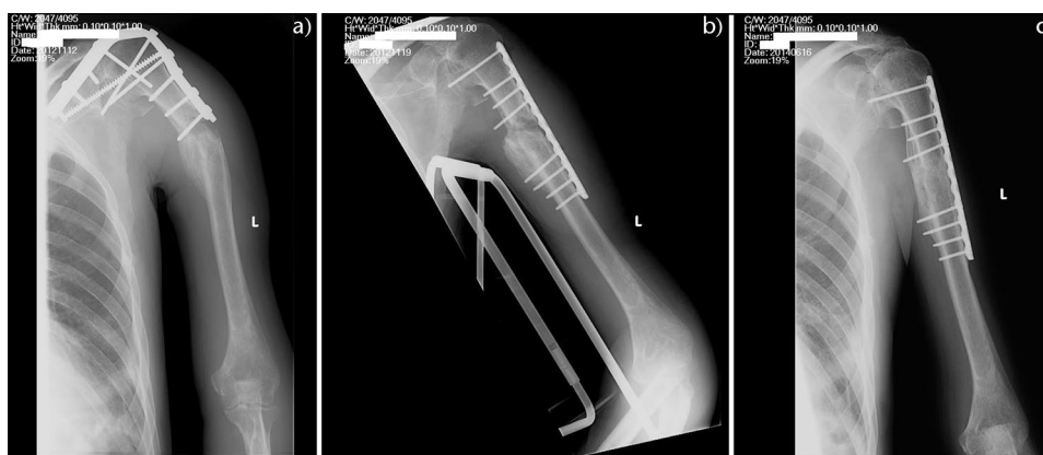
Fig. 2 Active shoulder flexion and abduction after arthrodesis.

Only a few collected articles describe the shoulder's preoperative range of motion, and this description was significantly limited. Some authors attempted brachial plexus revision, neurolysis, transfer of the accessory nerve to the suprascapular nerve, or reconstruction of the suprascapular nerve with an autograft to improve shoulder function. Due to the lack of significant improvement in function after reconstructive procedures, it was decided to perform arthrodesis of the shoulder. After surgery, the range of motion was on average 59° of flexion and 55° of abduction, while some patients achieved significantly better results, at a level of 90–100° of active flexion and abduction (Fig. 2). It is much more important to assess the ability