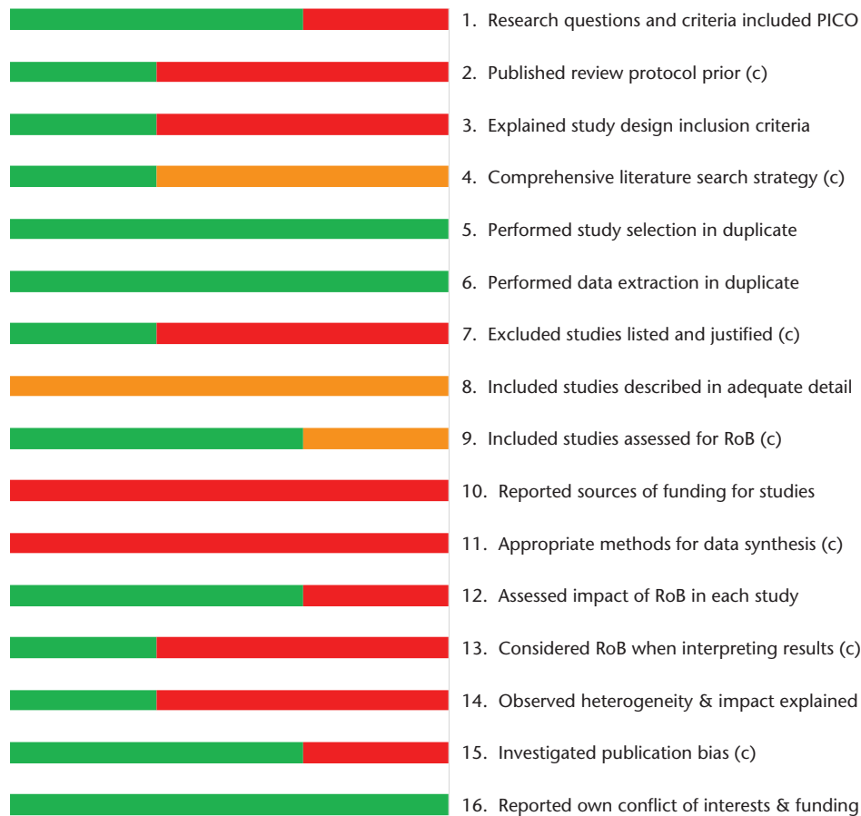
Fig. 2 Critical AMSTAR-2 domains for the assessment of the meta-analyses.

Note. AMSTAR-2, A MeaSurement Tool to Assess systematic Reviews; PICO, Population Intervention Comparator Outcome; RoB, risk of bias; c, critical.