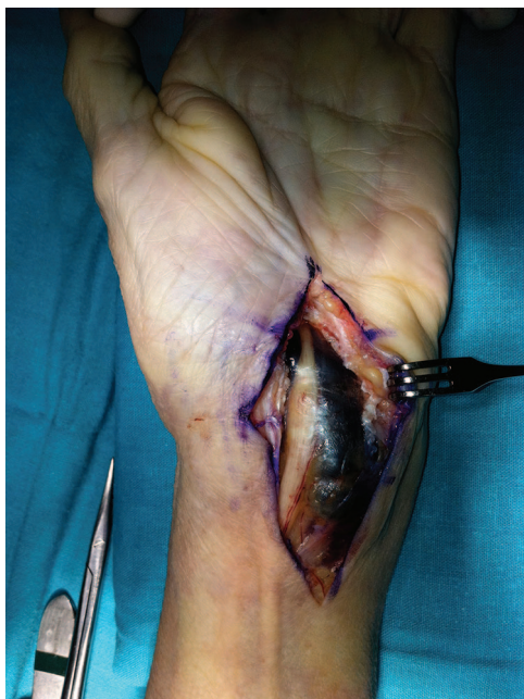
Fig. 2 Clinical picture of a surgical case of carpal tunnel syndrome (CTS) release. A 51-year-old woman with pain and paresthasias of the median nerve territory of her left hand was treated with adequate replacement therapy and surgical release after progressive symptoms. An extensile volar approach was used to adequately explore the extent of the haematoma. After carpal tunnel release, evacuation of the haematoma and neurolysis of the median nerve, the patient recovered swiftly.

test, and will show neurologic impairment of the median nerve. The diagnosis requires careful clinical evaluation, as initial clinical features may be subtle. The investigation of choice for acute CTS is an MRI of the wrist to image the carpal tunnel and to exclude articular pathology. When this investigation is not available, ultrasound scans are useful to image the soft tissue mass combined with radiographs to exclude an acute fracture. Differential diagnosis must be made with fractures, dislocations, and haematoma causing compartment syndrome.