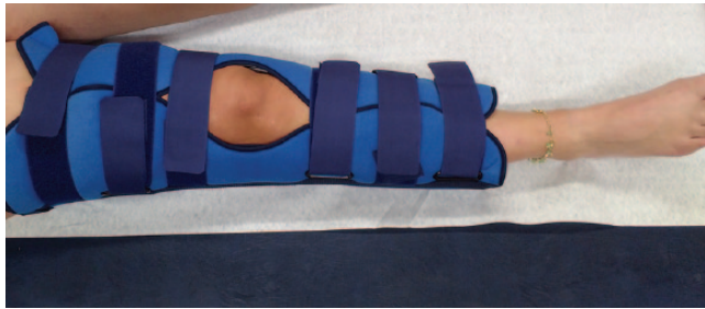
Fig. 2 Removable posterior splint.