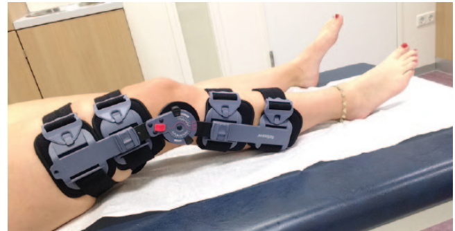
Fig. 3 Flexion-limited brace.

applied in the rehabilitation phase after a period of immobilization. In this section, the rationales and results of the options for conservative treatment are discussed in more detail.