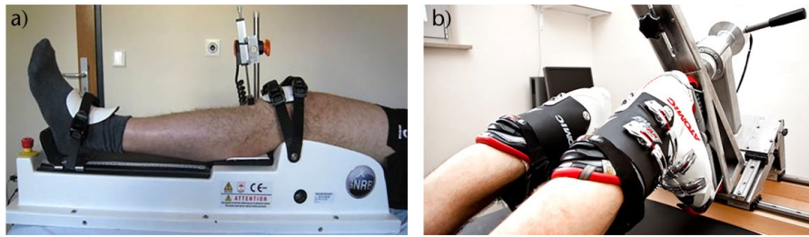
Fig. 3 Anterior and rotational knee laxity measurement devices: a) the GNRB: the ankle and patella of the tested leg are fixed and a motorised platform applies the anterior force behind the shank. The sensor placed on the tibial tuberosity measures the anterior displacement; b) the Rotameter: the individual is lying prone while wearing ski boots attached to the frame of the device. The handle bar allows the examiner to apply the torque both in internal and external rotation.