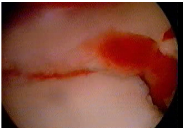
Fig. 2 Arthroscopic view of intra-operative reduction of a three-fragment glenoid fracture.

symmetrical ROM and a potential to return to previous activities after only three months and to full sporting activities at six months. The main explanation is that in those kinds of fractures, the ligaments are intact or partially injured and, to obtain fracture healing, it is only necessary to realign the fractured portions. Takase, Kono and Yamamoto 16 developed ARIF for Neer type 2 fractures using an artificial ligament with EndoButton (Smith & Nephew; Andover, Massachusetts) fixation on the coracoid, and a screw with a washer on the clavicle. With the technique proposed by Motta et al, 17 consisting of fixation with the AC TightRope (Arthrex; Naples, Florida), the biggest concern appeared to be age >60 years, which was also a key negative prognostic factor. It allows an improved view of the coracoid process and of the tunnel to be prepared, a prompt diagnosis of associated lesions in the shoulder joint, a better aesthetic outcome, a closed reduction without the need for a delayed hardware removal, better pain