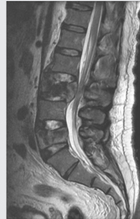
Fig 4 MRI scan sagittal view with intact posterior ligamentous complex.