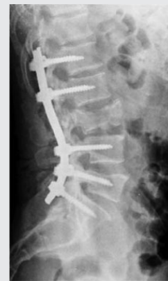
Fig. 5 Standing post-operative radiograph following posterior approach.