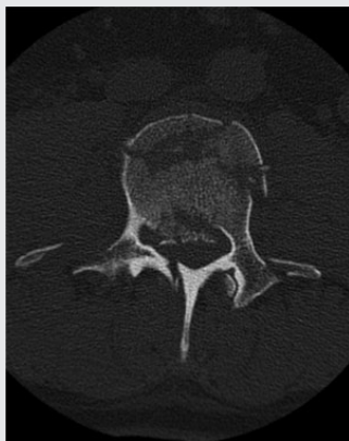
Fig. 2 Level III axial view.