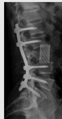
Fig. 6 Standing post-operative radiograph following posterior-anterior approach.